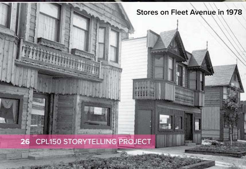
Stores on Fleet Avenue in 1978