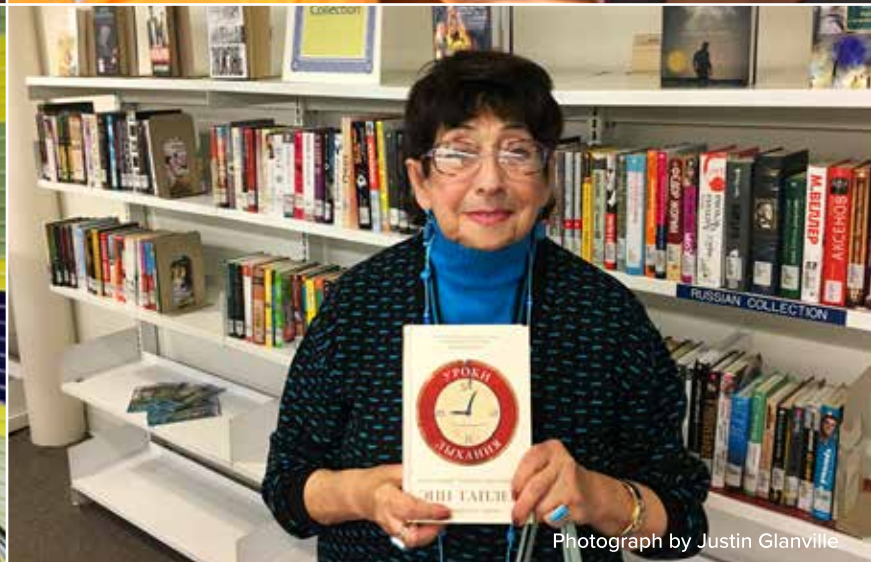
Photograph by Justin Glanville