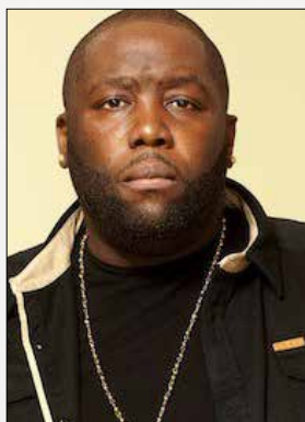
Michael "Killer Mike" Render