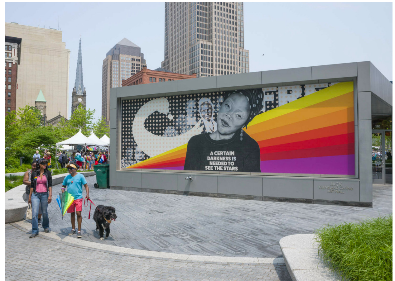
Example of artwork featured on the Public Square Art Wall