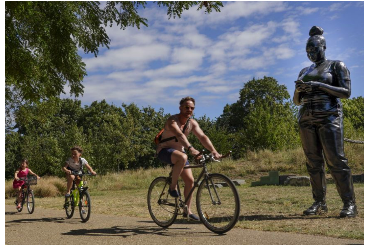
Example of figurative sculpture by London-based artist