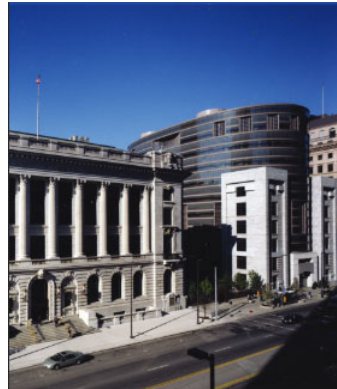
Main Library Louis Stokes Wing