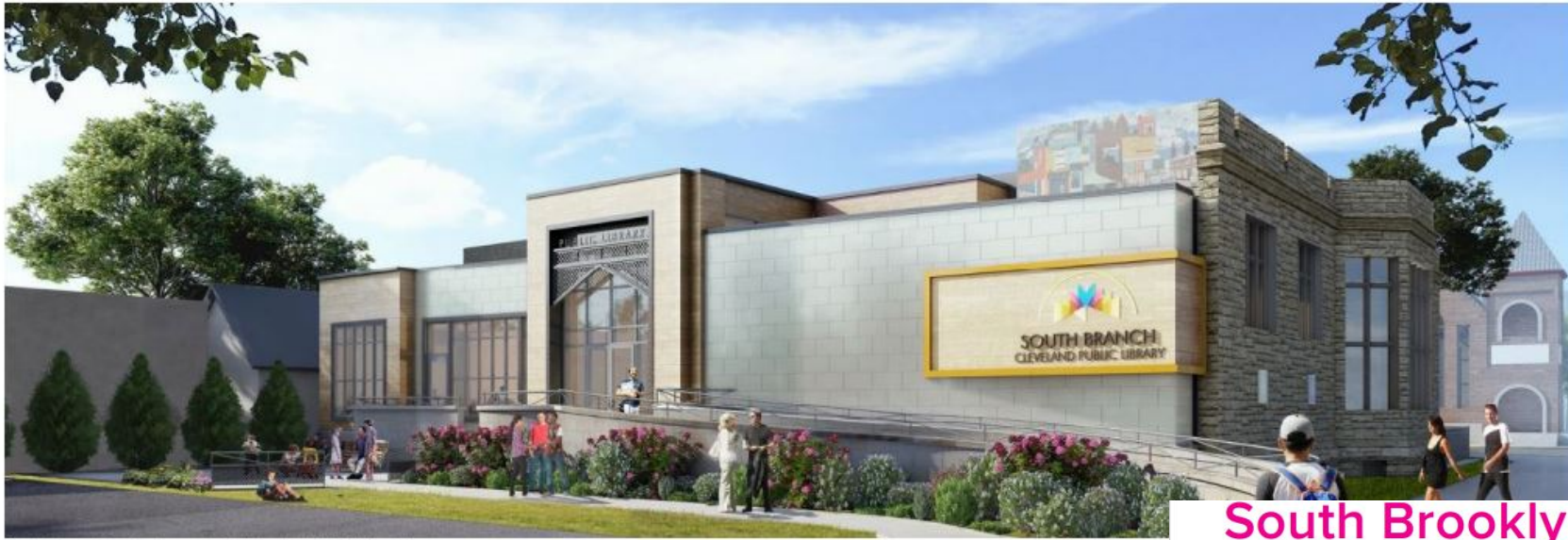
South Branch Design Concept [Architects: HBM Architects]