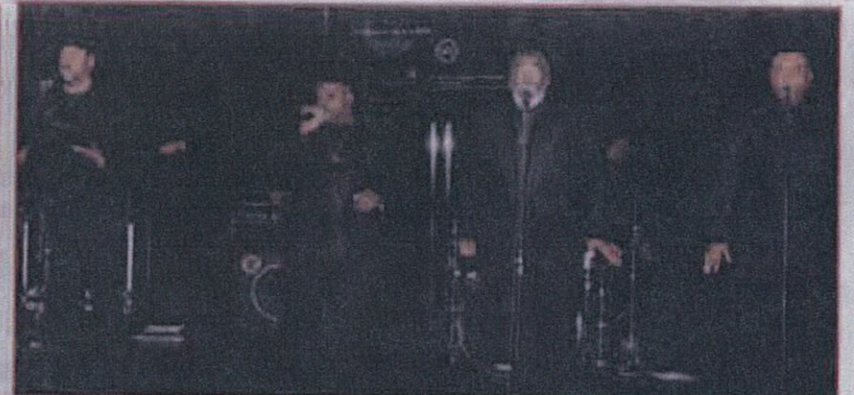
The group Retrospect sing for the guests.