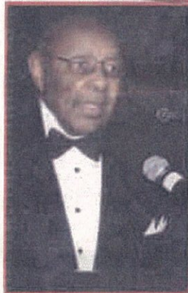
The honorable Louis Stokes served as the 95th Anniversary chair.