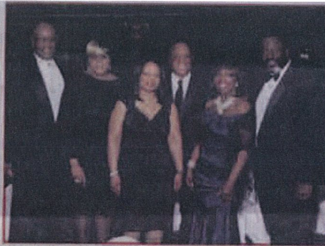
Dominion Gas guests.