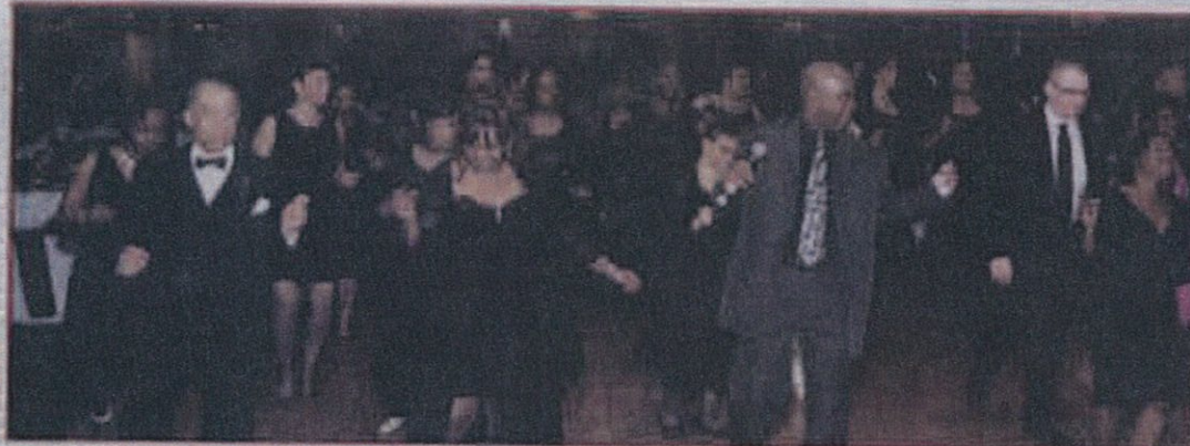
Guests had a chance to line dance during the evening.