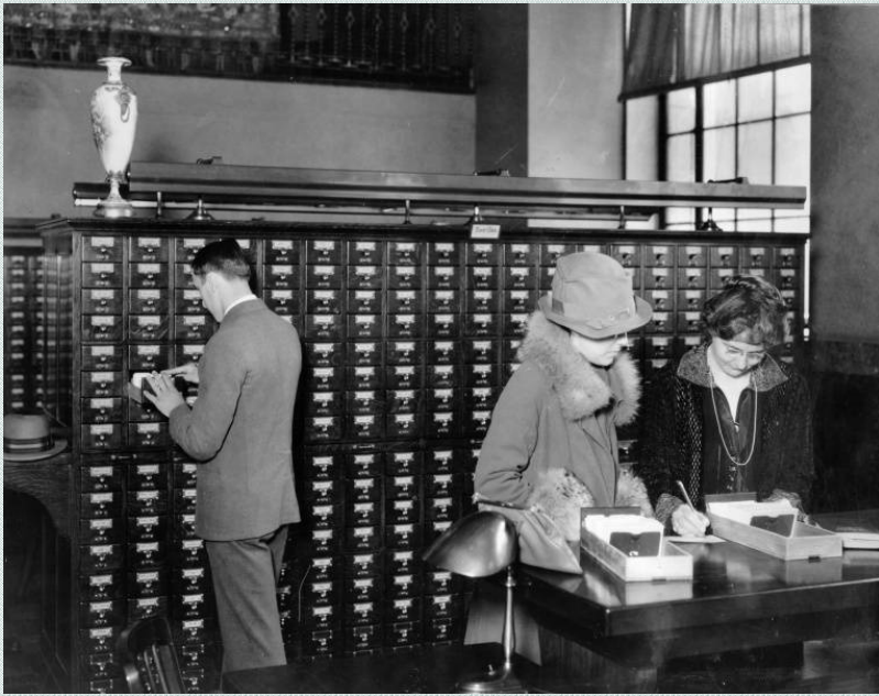
Public Catalog Room